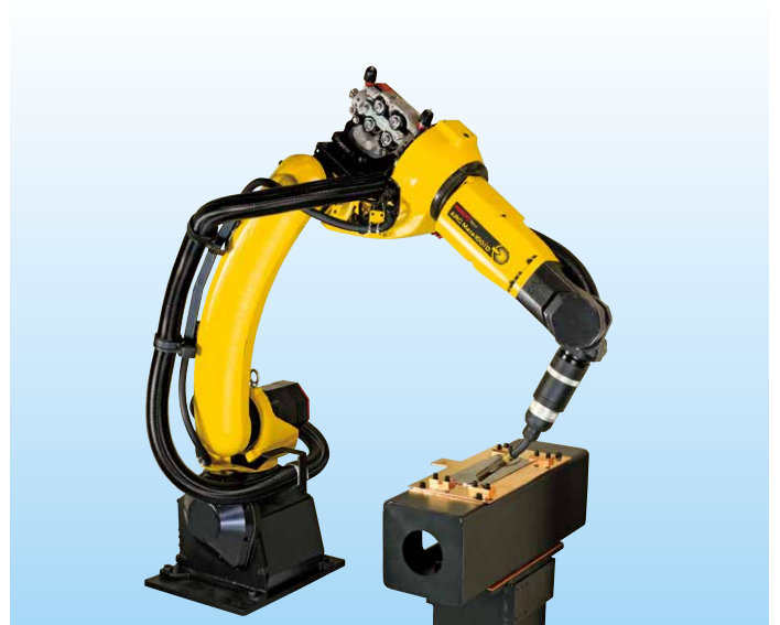
Stainless part welding