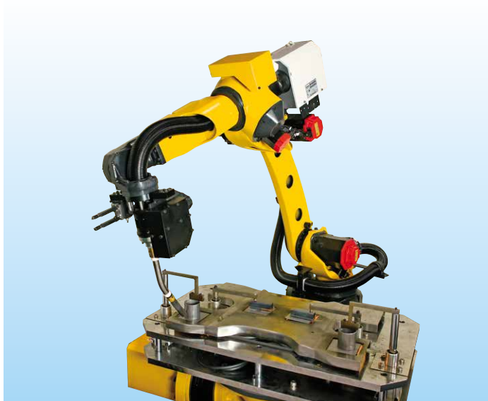
Automotive part welding