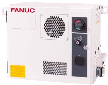
R-50iA Mate Controller