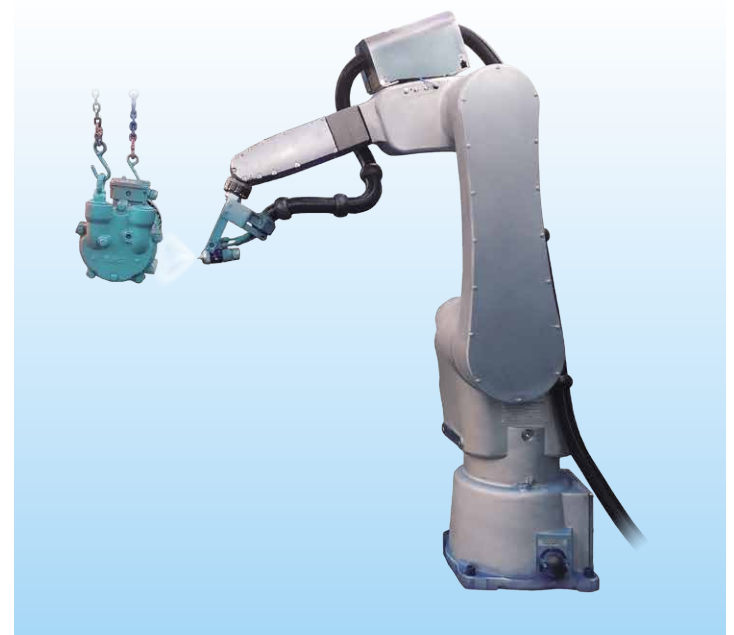
Small part painting