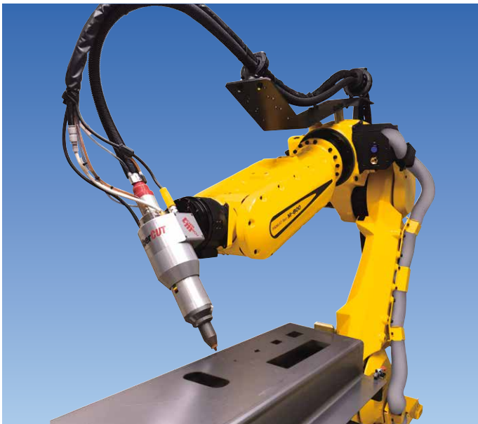
High Accuracy Laser Cutting