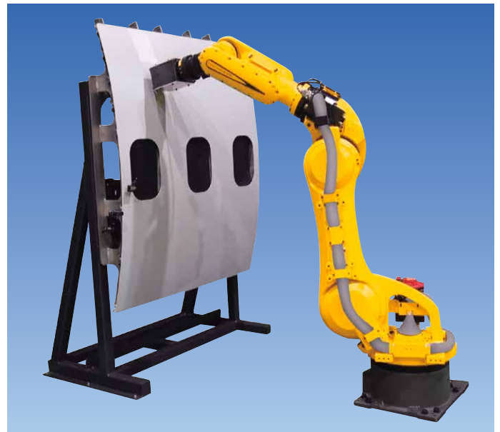
High Accuracy Drilling System