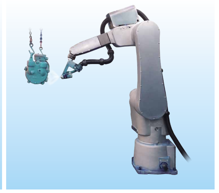
Small part painting